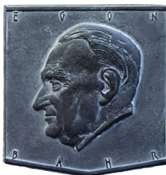
Prof. Dr. h.c. Egon Bahr (deceased)

The 2015 Emperor Otto Prize is being awarded for the very first time to an institution: the Organization for Security and Co-operation in Europe (OSCE). The Emperor Otto Cultural Foundation and the City of Magdeburg are thereby paying tribute to the OSCE's commitment to the peace and peaceful coexistence of all Europeans. Set up by the Conference for Security and Co-operation in Europe, the organisation plays a key role in political conflict resolution and prevention in Europe, as well as in the consolidation of peace, the protection of human rights, the promotion of democratisation, and the monitoring of elections. Through its dedication to its work, the OSCE has been able to make a singular contribution to stability in Europe and its neighbours.