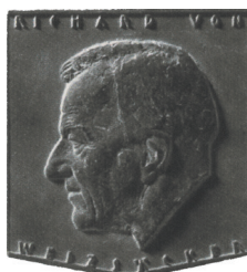
Dr. Richard von Weizsäcker (deceased)

Prof. Dr. Vaira Vike-Freiberga, who was then the President of the Republic of Latvia, was awarded the Emperor Otto Prize on 9 May 2007, Europe Day. She was selected for the honour in recognition of her personal and political contribution to international understanding and the European idea in the Republic of Latvia. Her unequivocal denouncements of totalitarianism and fascism demonstrated Prof. Dr. Vike-Freiberga's commitment to a policy of freedom and European federation which enshrines and advances political, cultural and social diversity.