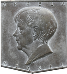
Dr. Angela Merkel

On 24 August 2011, the Chancellor of the Federal Republic of Germany was awarded the Emperor Otto Prize. The City of Magdeburg thereby paid tribute to her outstanding commitment to European policy. With her unique perspective, Federal Chancellor Dr. Angela Merkel has done much since 2005 to further European integration, understanding between the peoples of Europe, and the stability of the European Union, which has improved Germany's standing both within the EU and elsewhere in the world.