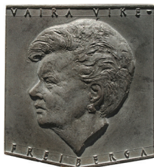
Prof. Dr. Vaira Vike-Freiberga

Prof. Dr. Vaira Vike-Freiberga, who was then the President of the Republic of Latvia, was awarded the Emperor Otto Prize on 9 May 2007, Europe Day. She was selected for the honour in recognition of her personal and political contribution to international understanding and the European idea in the Republic of Latvia. Her unequivocal denouncements of totalitarianism and fascism demonstrated Prof. Dr. Vike-Freiberga's commitment to a policy of freedom and European federation which enshrines and advances political, cultural and social diversity.