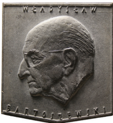
Władysław Bartoszewski (deceased)

On 24 August 2011, the Chancellor of the Federal Republic of Germany was awarded the Emperor Otto Prize. The City of Magdeburg thereby paid tribute to her outstanding commitment to European policy. With her unique perspective, Federal Chancellor Dr. Angela Merkel has done much since 2005 to further European integration, understanding between the peoples of Europe, and the stability of the European Union, which has improved Germany's standing both within the EU and elsewhere in the world.